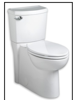
American Standard Cadet